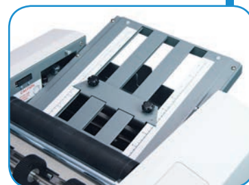
Clearly marked fold plates are easy to adjust